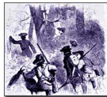
Insurgents of Shays' Rebellion Patriots or traitors? Farmers from western Massachusetts followed petitions for economic relief with insurgency in the fall of 1786. A group of protestors, led by Revolutionary War veteran Daniel Shays, began a 6-month rebellion by taking over the Court of Common Pleas in Northampton; the goal was to prevent the trial and imprisonment of debt-ridden citizens.

While Governor Bowdoin had acted decisively in crushing the rebellion, the voters turned against him in the next election. This high level of discontent, popular resistance, and the election of pro-debtor governments in many states threatened the political notions of many political and social elites. SHAYS' REBELLION demonstrated the high degree of internal conflict lurking beneath the surface of post-Revolutionary life. National leaders felt compelled to act to put an end to such popular actions that took place beyond the bounds of law.