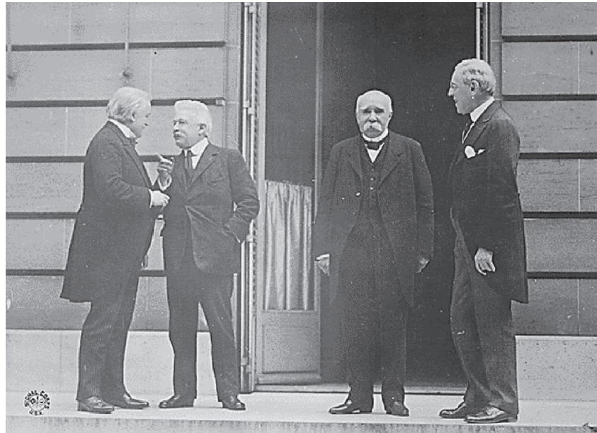
The Big Four: Lloyd George, Orlando, Clemenceau, and Wilson.

Paris in January 1919 was filled with reminders of the war at every turn. Piles of rubble remained where German artillery shells had fallen. The famous stained glass windows of the Cathedral of Notre Dame remained in storage, replaced with unremarkable yellow panes of glass. Refugees and limbless soldiers filled the streets while victory flags flew in the breeze. Neither the British nor the Americans had wanted the peace conference to be in Paris (they would have preferred a location in a neutral country with a less charged atmosphere),