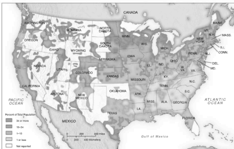
FOREIGN-BORN POPULATION, 1890 Immigrants tended to settle in regions where jobs were relatively plentiful or conditions were similar to those they had left in their homelands. Cities of the Northeast, Midwest, and West offered job opportunities, while land available for cultivation drew immigrant farmers to the plains and prairies of the nation's midsection.